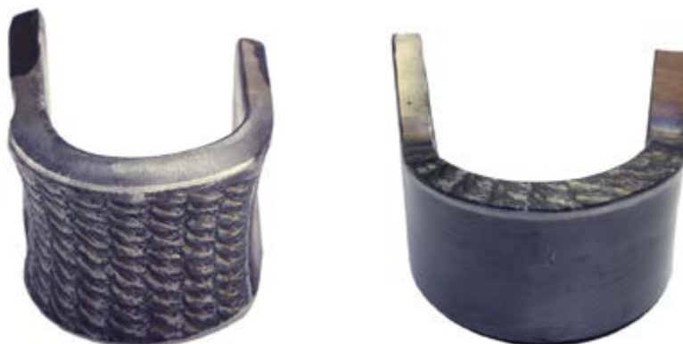
Face Bend: Optimum bead-to-bead tie-in. Side Bend: Fully fused bond line.