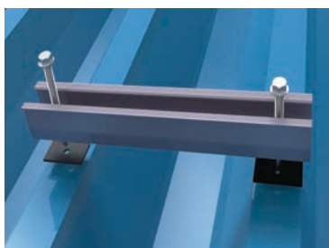
Secured the mini rail across the roof ridges with tapping screw(6.3x25)