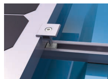
Fixing the panels on rails by mid clamps