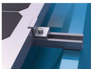
Fixing the panels by end clamps